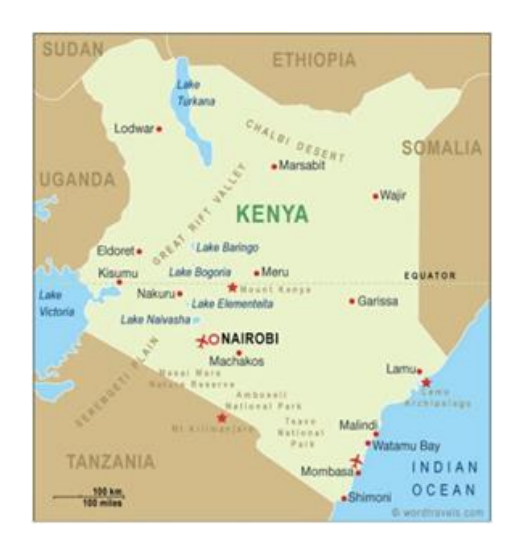
Figure 3 Map of Kenya

The map of Kenya, for reference purpose, is as follows: